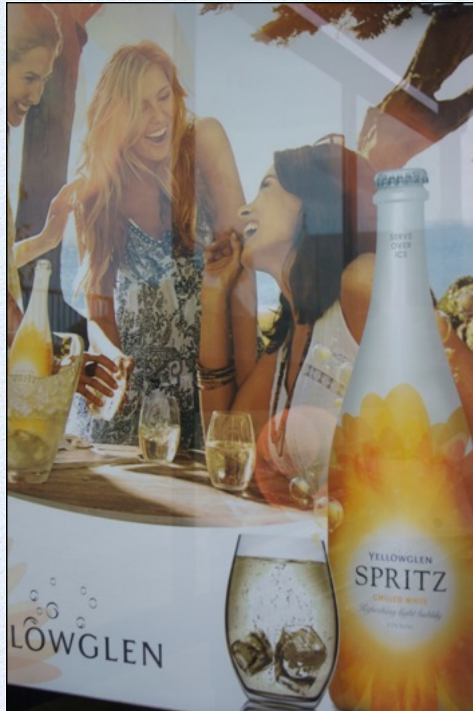
Plate 3: Yellowglen Spritz - Bus shelter Kings Park Road, West Perth (City of Perth)