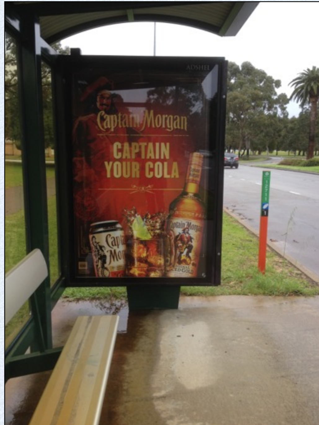
Plate 1: Captain Morgan Original Spiced Gold Rum - Bus shelter Lake Monger Drive, Leederville (Town of Cambridge)

Note: This ad was the subject of a complaint to the Alcohol Advertising Review Board [Reference 321/14, 27 August 2014]