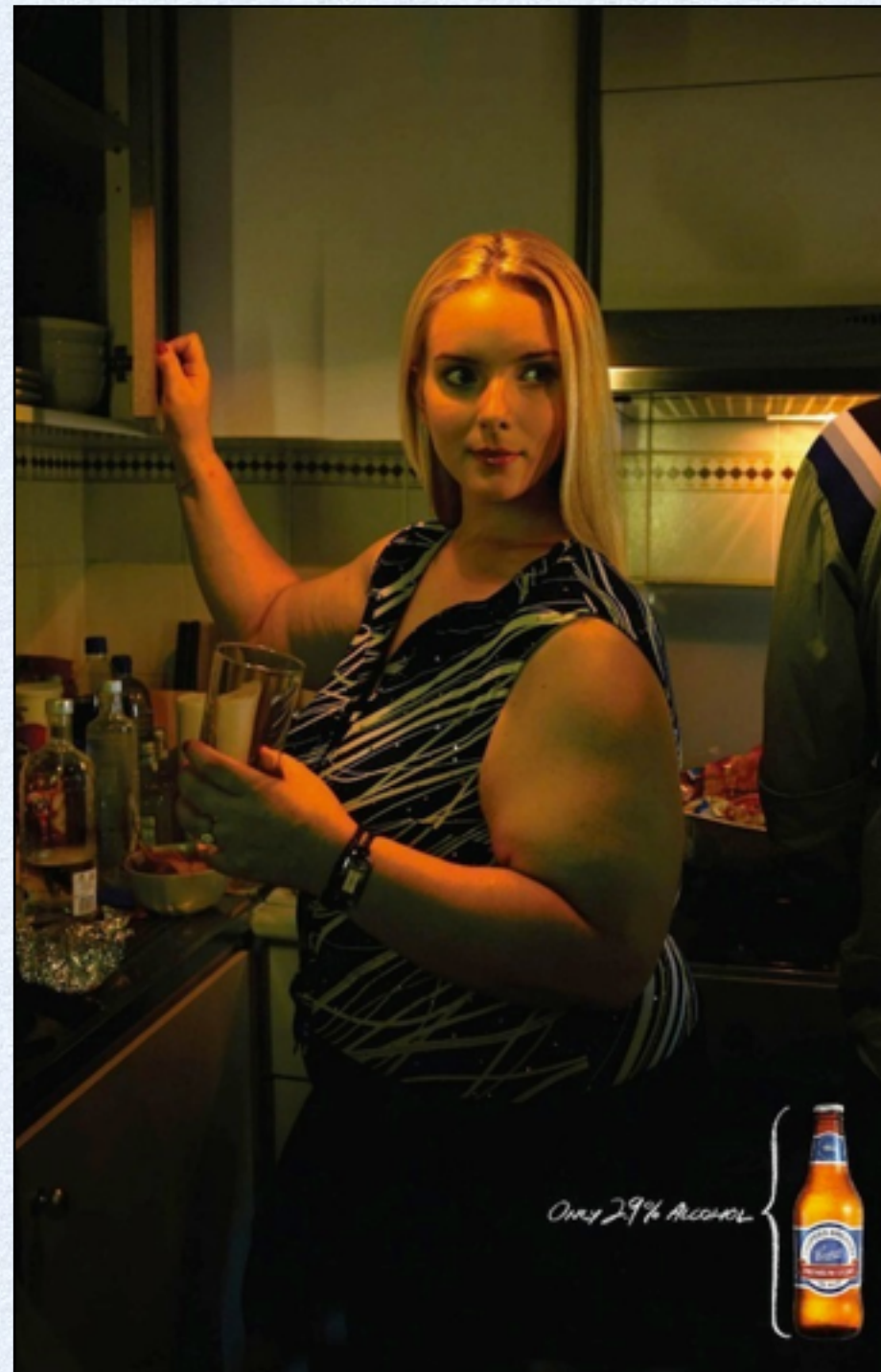
Plate 6: Coopers Premium Light 2.9% - Bus shelter Hay St, Perth (City of Perth)