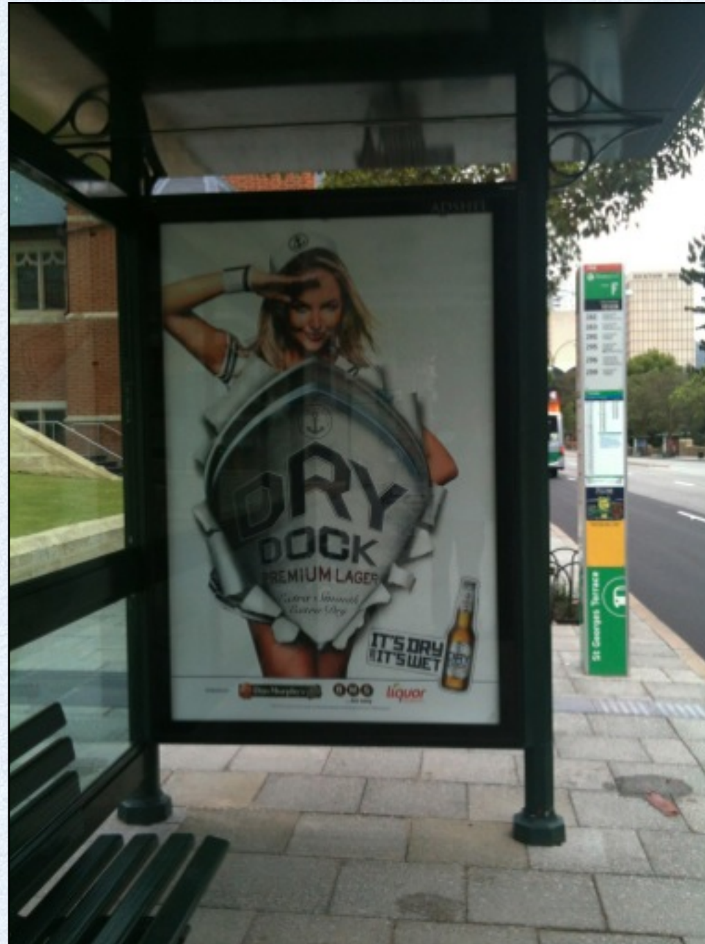
Plate 2: Dry Dock - Bus shelter St George's Tce, Perth (City of Perth)

Note: This ad was the subject of a complaint to the Alcohol Beverages Advertising Code Complaints Panel [Determination 35/11, 26 May 2011]